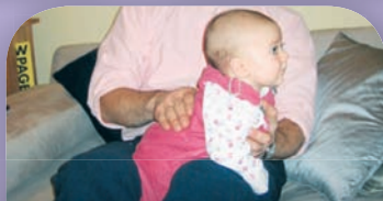
Look how far I can see...