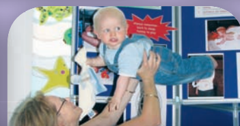
Look how strong I am now