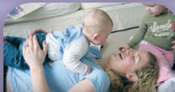
We can all have fun on the floor...