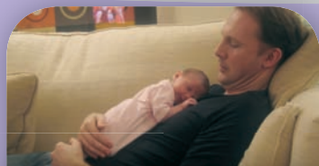
We love our cuddle time