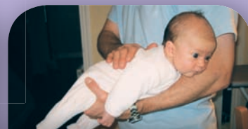
Flying starts young